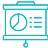
Budgeting for Forecasting