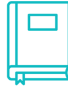
Corporate TAX Registration