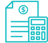
Corporate Tax Filing